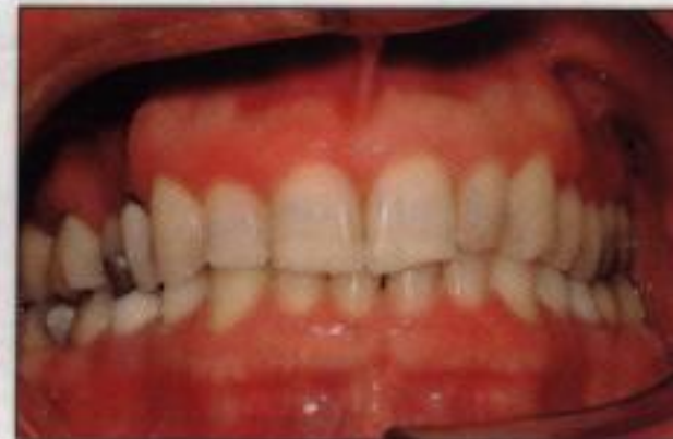
Figure 2. Preoperative facial view of the dentition in maximum intercuspation position.