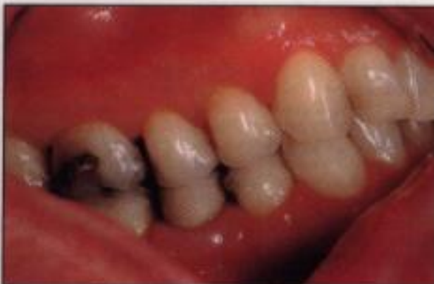
Figure 4. Preoperative left posterior lateral view of occlusion.