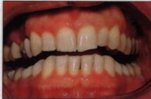
Figure 1. Preoperative retracted facial view illustrating uneven occlusal plane and gull wing appearance of dentition.

A 45-year-old male, referred by a periodontist, presented with unsatisfactory dental restorations, a chronic dysfunction of temporomandibular joints (TMJs), and assorted occluso-muscular pain. The patient acknowledged a severe clenching and bruxing habit, resulting from a stressful work environment. Several clinicians had attempted to treat the dysfunction by equilibration but without success. In the process, the vertical dimension of the