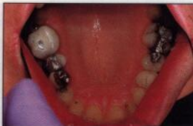
Figure 5. Preoperative occlusal view of the maxillary dentition.