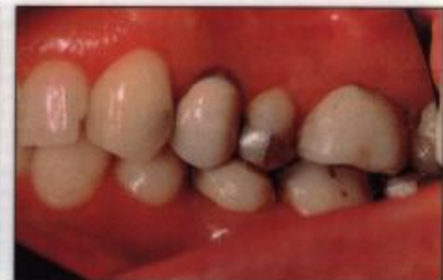
Figure 3. Preoperative right posterior lateral view of occlusion.